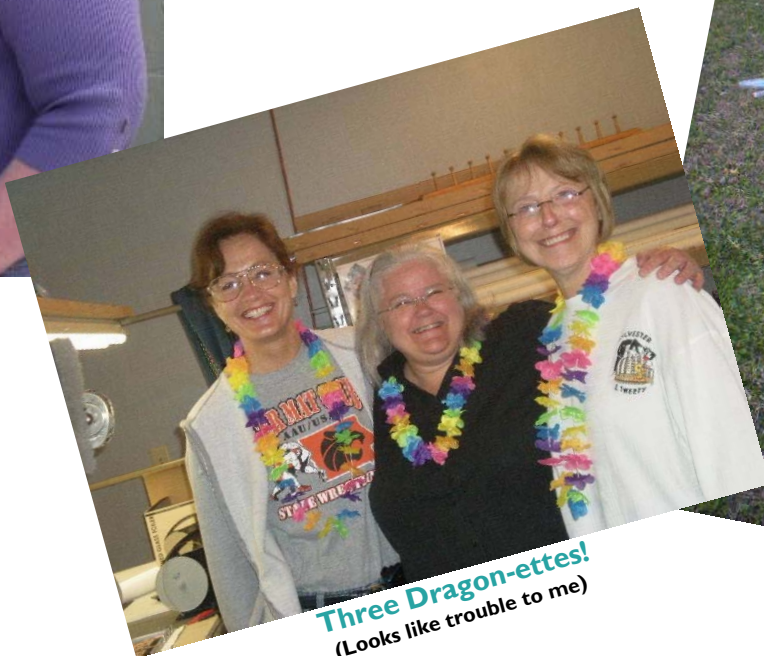
Three Dragon-ettes! (Looks like trouble to me)