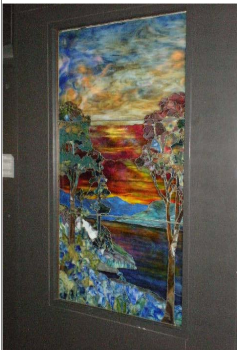
A plated Tiffany window at The Smith Museum in Chicago